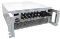
High Power Density Bi-Directional DC-DC Converter Modular Design